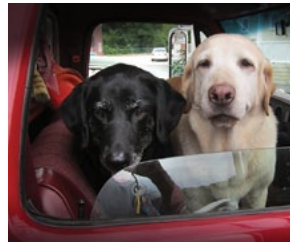
New Room program alumni Hunter and Shiloh enjoy the view from their new truck. See back cover for their story.

W e Are Animal Guardians, Inc. (WAG) is an all-volunteer animal rescue organization that serves 17 communities in central New Hampshire, most of which are not covered by other animal shelters. Since its inception in 1996, WAG's adoption program has provided an unusually high level of service for its animals and adoptive families. WAG's adoption process includes caring for each animal in a foster home until it is adopted. This insures a high quality of life for the animal during the weeks, months,